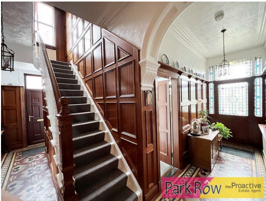
COMMUNAL LOUNGE 4.20 x 4.60 (13'9" x 15'1")